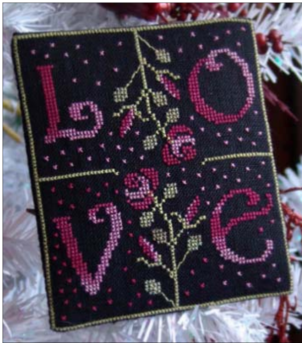
Love $6.00 By New York Dream