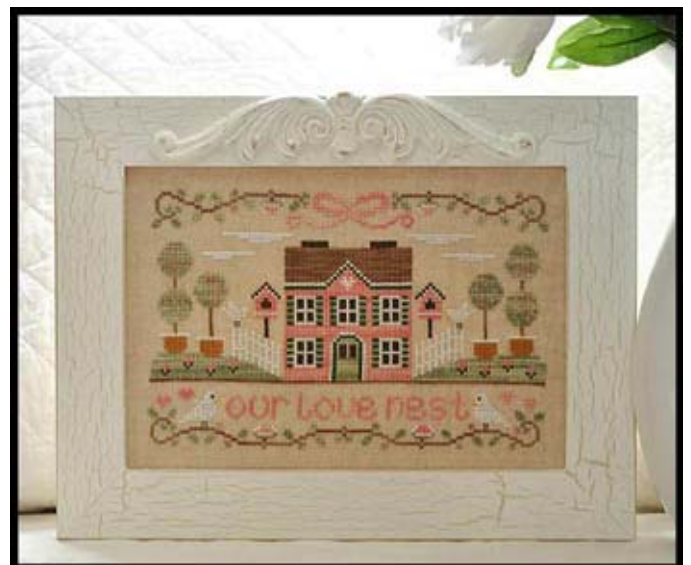
Our Love Nest $8.00