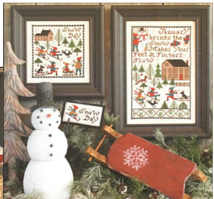
August and January

have been released—two cute designs in each leaflet