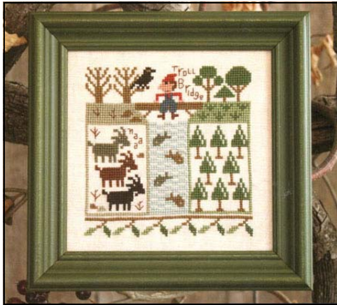
3 Billy Goats Gruff