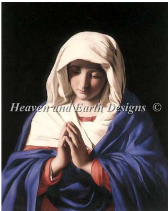
Virgin in Prayer $15.00