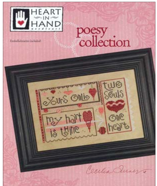
Posey Collection $14.50 includes charm