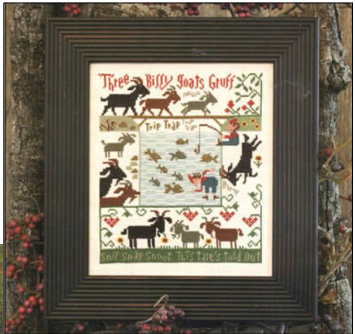
Bunnies 9 darling designs