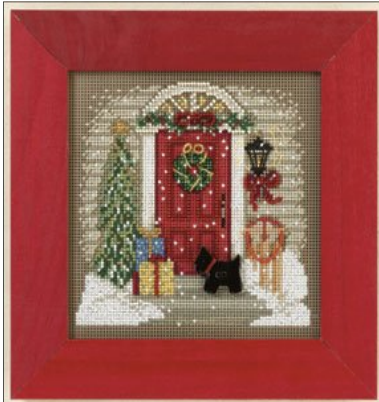
Home for Christmas